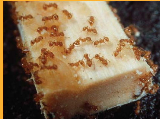
Little fire ants on the big end of a chopstick

A Tiny New Stinging Ant Is Spreading Across Hawai'i