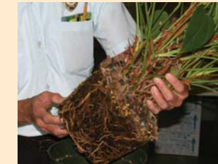
Carefully inspect plants before transporting them

The little fire ant is native to Central and South America, but it has spread around the Pacific. It was first noticed in Hawai'i in 1999 at Hawaiian Paradise Park in Puna. Although