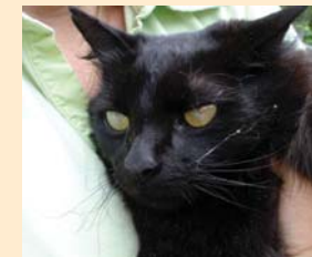
Pet with clouded corneas

In the Galapagos Islands, when LFA populations are large, workers are prevented from harvesting coffee.