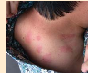
LFA easily fall from trees and get under clothes

The ants climb up into plants of all sizes, including trees. They drop off easily when the plants are disturbed, and they can rain down on you in large numbers when you are pruning branches, harvesting fruit, or picking flowers. Some orchard workers in East Hawai'i have quit their jobs because of this.